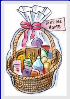
Grocery Hamper Collection for our Ground Staff

A heartfelt appreciation to all parents and learners who have generously donated non-perishable food items for our PS staff. For those who haven't had the opportunity yet and plan to contribute, kindly ensure that these items are handed to the class teacher by December 1, 2023. Thank you for your support!