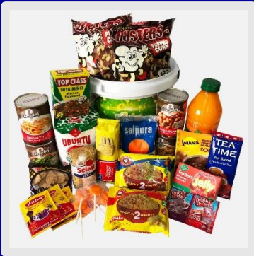
Grocery Hamper Collection for our Ground Staff

Let's express our gratitude and offer our support to the dedicated efforts of our ground staff who diligently maintain our school grounds and facilities week after week. We are gathering non-perishable food items to create food hampers for our general assistants as a token of our appreciation. Please donate a non-perishable food item to help us make a food hamper for our PS ground staff.