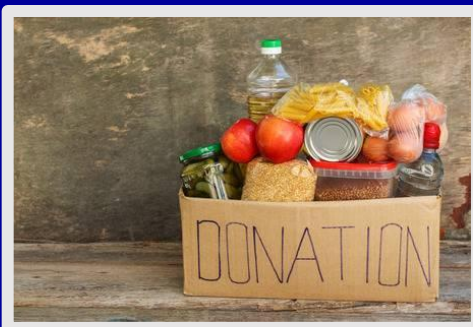
Grocery Hamper Collection for our Ground Staff

Just a friendly reminder that we're currently gathering donations to create grocery hampers for our dedicated Ground Staff, who work tirelessly to maintain the cleanliness of our classrooms, restrooms, and school grounds every day. We kindly request your support for this food drive as a small gesture of our appreciation for the invaluable behind-the-scenes work they do day in and day out. Your support is immensely appreciated.