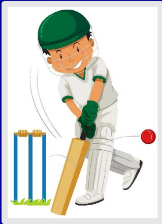
Term 4 Extra Murals

On Thursday, 2 nd November 2023, the U9 cricket team will be competing at Blairgowrie, while the KFC Mini Cricket Team will be engaged in matches hosted at Rosebank Primary.